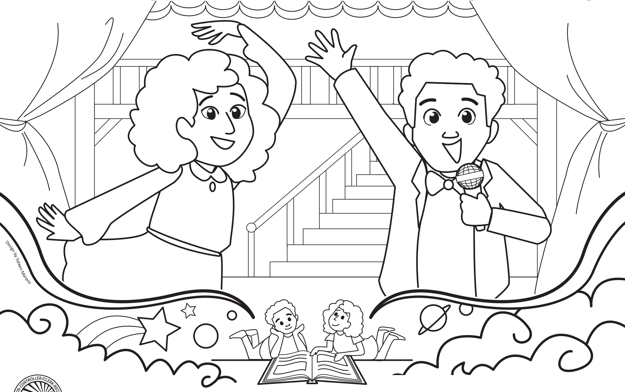
Celebrating Arts Education & Lifelong Learning!