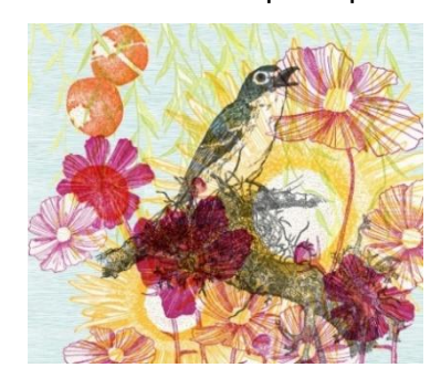
Materials: Letterpress printing from pen and ink drawings and digital collage