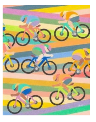
Materials: Color pencil on paper