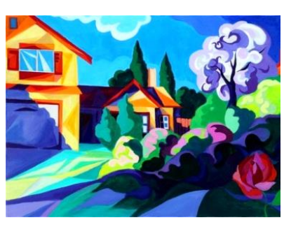
Artist: Rhonda Chase Materials: Pen, ink and digital illustrations