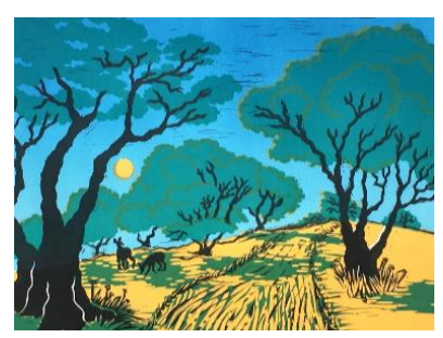
Artist: Alice Beasley Materials: Textile quilts